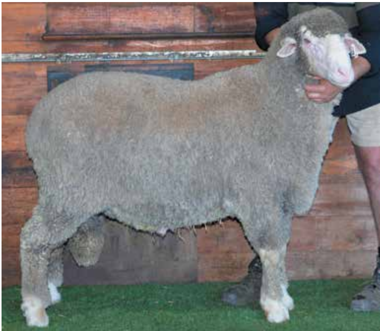
KNP225 Sired by Banavie - Sale Ram Pen ? Mic 19.4 SD 3.0 CV 15.5 CF 99.7