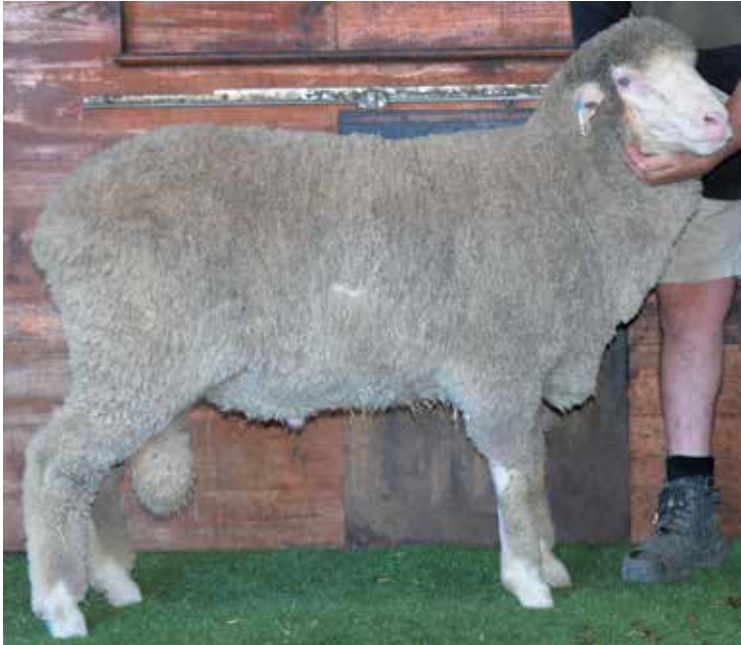
KNP610 Sired by KNP3 - Stud Reserve Mic 19.9 SD 3.7 CV 18.6 CF 99.5