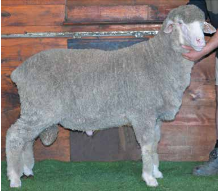
KNP291 Sired by Banavie - Elders Adelaide Mic 18.2 SD 3.3 CV 18.1 CF 99.7