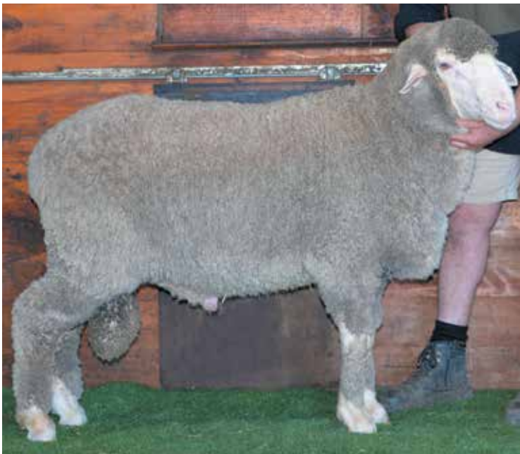
KNP359 Sired by Moorundie 201 - Elders Adelaide Mic 18.8 SD 3.5 CV 18.6 CF 99.2